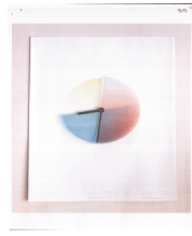
‘Farbfolge II (89/100)’