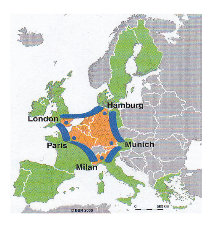
Europe: the pentagon

5.3 As a result of various factors including its 'historical heritage', a pentagon of economic growth taking in London, Hamburg, Munich, Milan and Paris has emerged as an economic hub comprising 20 % of the EU-15 surface area, 40 % of the total population and generating 50 % of wealth. This backbone of Europe incorporates 7/10 of the EU's decision-making power and over 85 % of its cities have good transport links (11). This backbone is referred to as a pentagon .