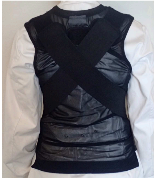
Front (inside out view):

The two elastic bands attached to the back: