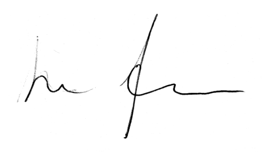
Für die Regierung der Bundesrepublik Deutschland