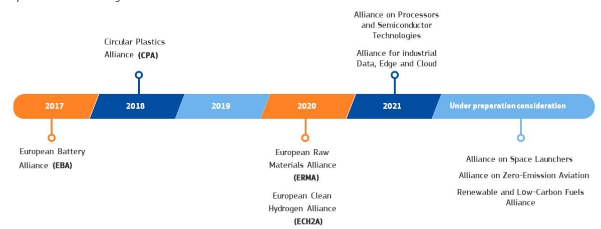
Graph 2: Overview of industrial alliances

Industrial alliances can play an important role in mobilising actors and investment in strategic areas, identifying regulatory barriers and enablers and building a suitable project pipeline. Existing industrial alliances, as shown in the graph below, have proved instrumental to strengthening European capacities (e.g. batteries). They are bringing tangible results by aligning European, national and private sector reform and investment priorities.