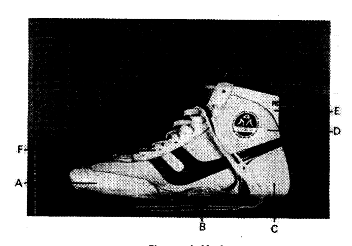
Photograph No 2 Parts A, B, C, E and F are of leather. Part D is of textile.