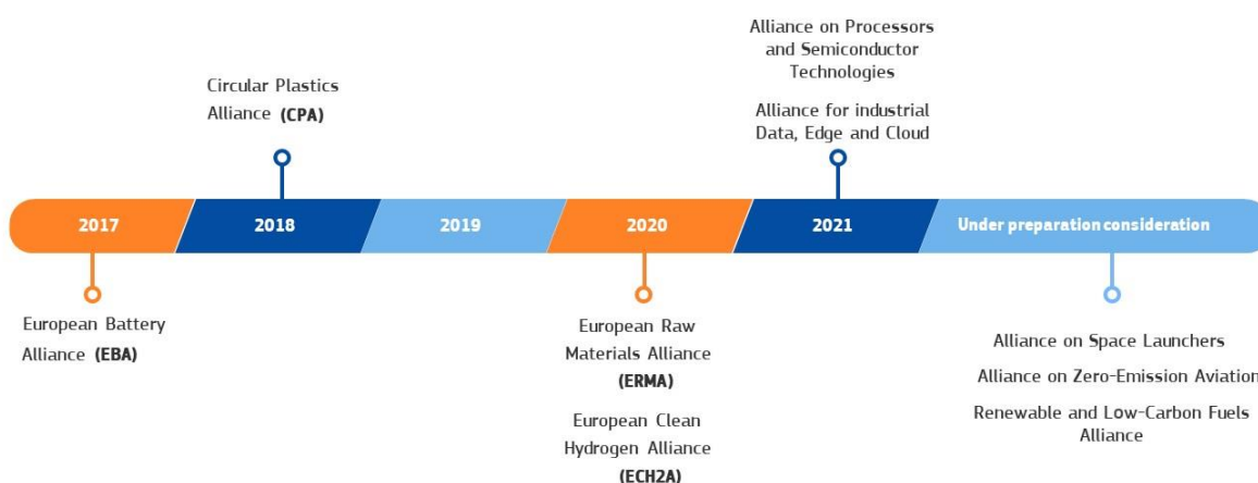
Graph 2: Overview of industrial alliances