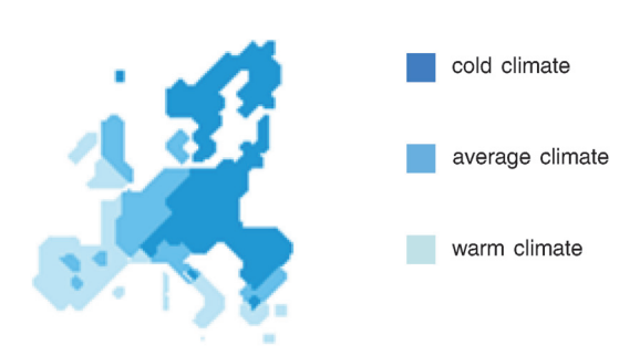
Figure 2 Climate condition areas

In cases where several climate conditions are existing within the same Member State, the Member States should estimate the installed capacity of heat pumps in the respective climate condition area.