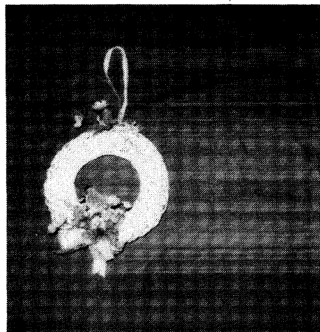
Photograph, by way of example, of case No 3