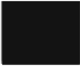
PANTONE REFLEX BLUE