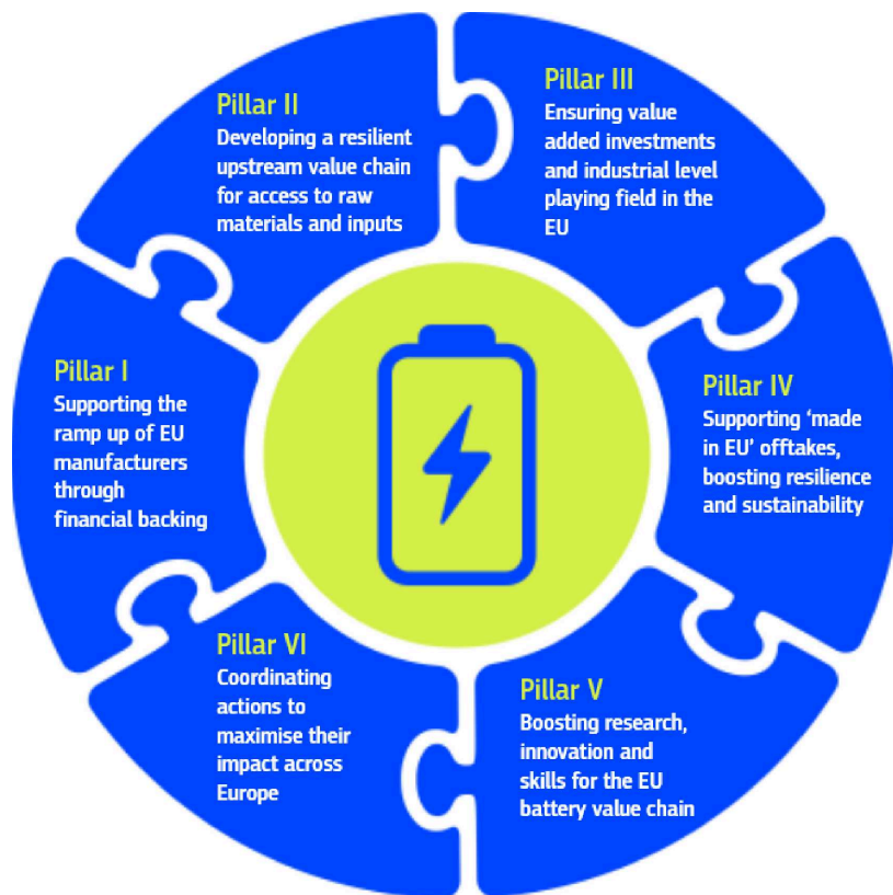
Figure 1. The six pillars of the Battery Booster