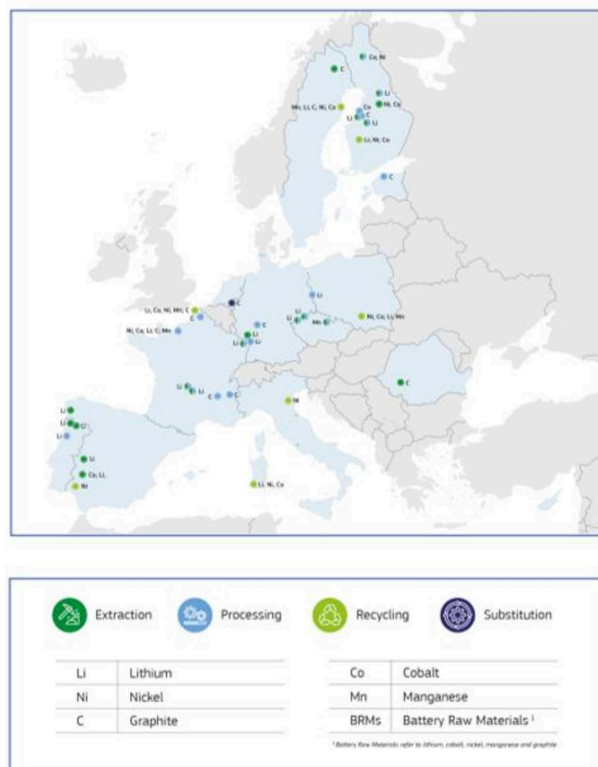
Figure 3. Battery related CRM Strategic Projects

The European Commission has taken significant steps to support the development of strategic raw material projects related to battery production . Earlier this year, it designated 32 projects in the EU focusing on battery raw materials such as lithium, nickel and graphite and 10 projects outside of the EU, all as strategic projects under the Critical Raw Materials Act. These projects will be eligible for simplified permitting and coordinated funding. The Commission has launched a second call for strategic projects, inviting project promoters to apply by 15 January 2026.