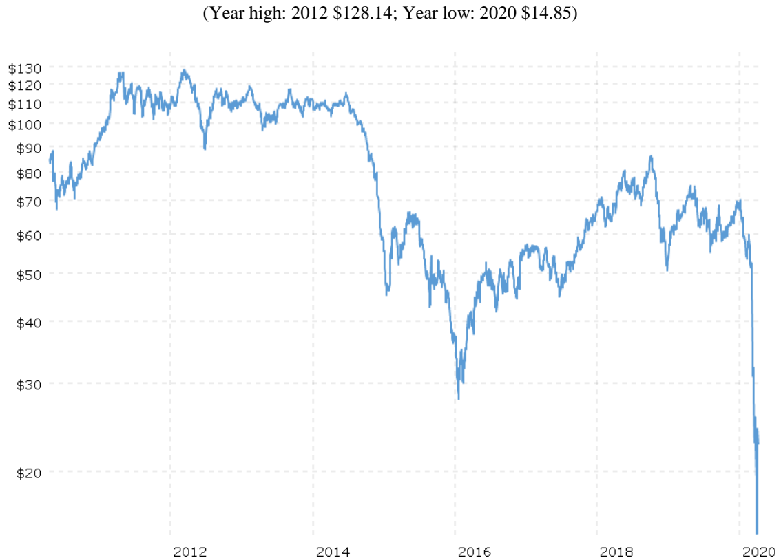
Figure 1: 10-year trend of Brent Crude price (US$/barrel)