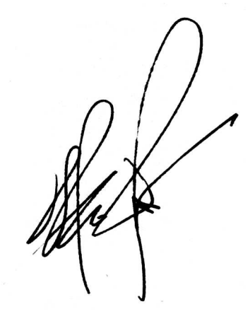
Por la República de Panamá