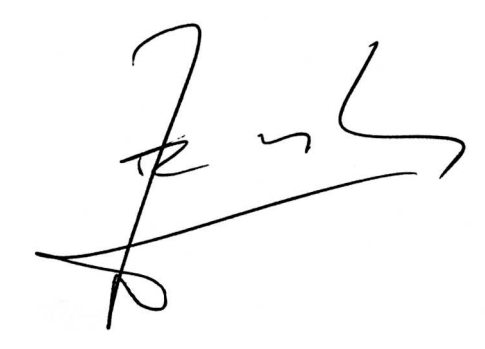
Voor het Koninkrijk der Nederlanden