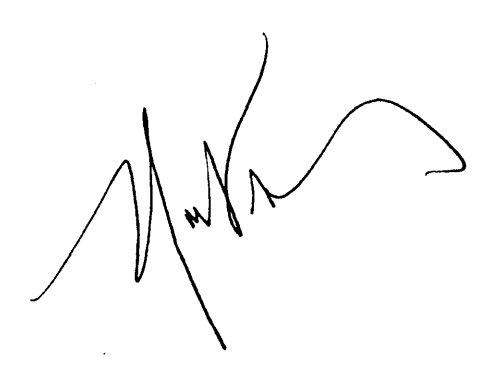
Pour le Président de la République française

Thar ceann an Choimisiúin arna údarú le hAirteagal 14 de Bhunreacht na hÉireann chun cumhachtaí agus feidhmeanna Uachtarán na hÉireann a oibriú agus a chomhlíonadh For the Commission authorised by Article 14 of the Constitution of Ireland to exercise and perform the powers and functions of the President of Ireland