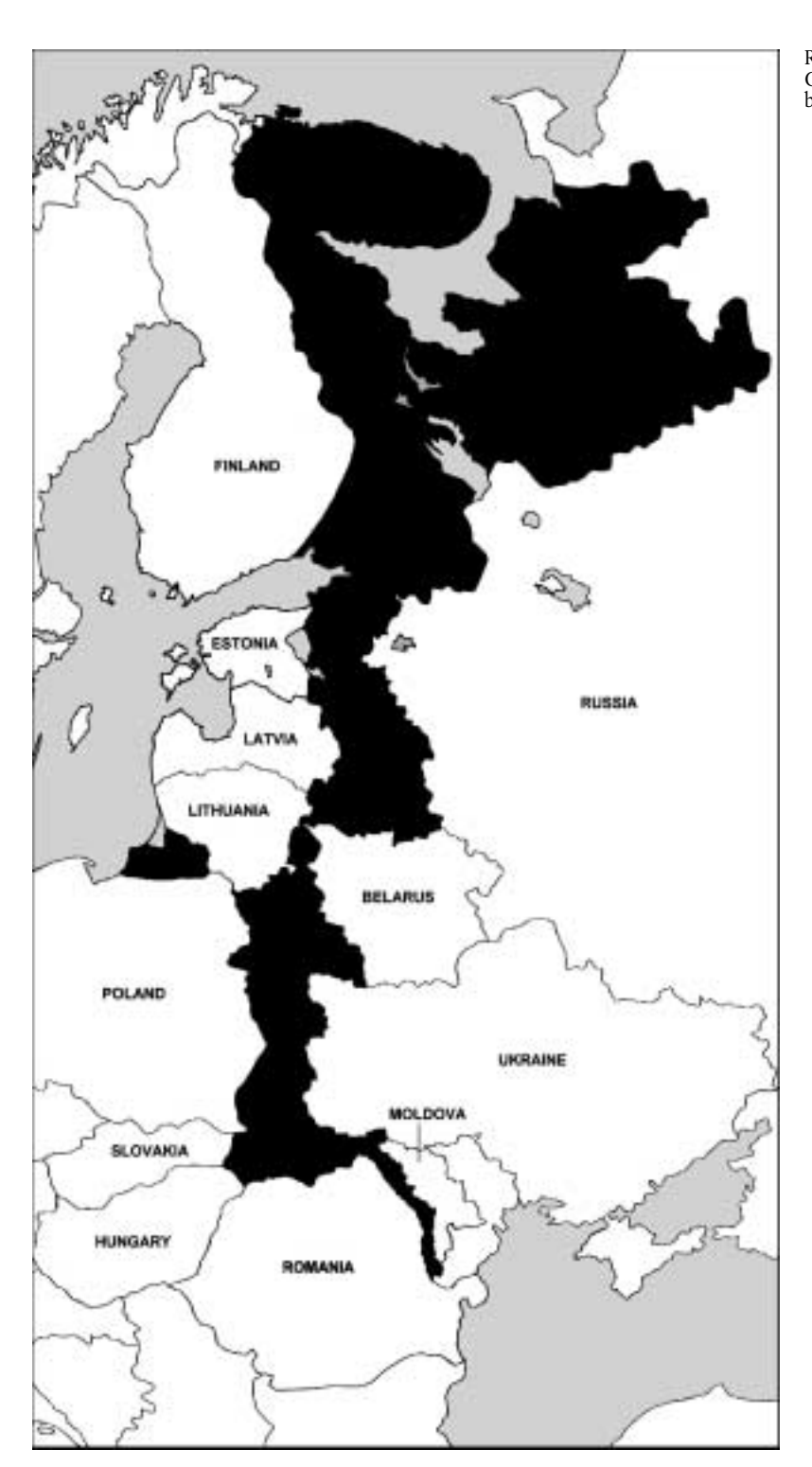
Regions eligible for the Tacis CBC programme are shown in black.